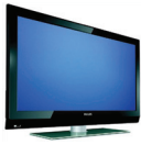
Television (1 year old)

How replacement cost works: An insurance company will first pay you the ACV of an item. Once the item is replaced and receipt submitted, the company will then settle up with you.